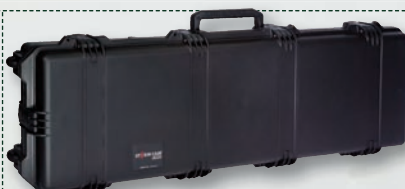
Pelican Storm Case