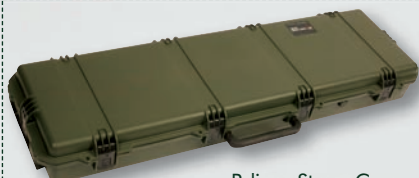
Pelican Storm Case